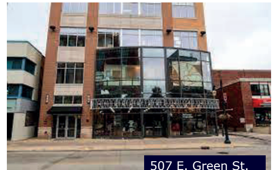
507 E. Green St.

- Institute for Government and Public Affairs –Contracted through the KRS102 award with a BEP vendor to provide web page redesign services